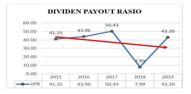
Figure-1. Dividend Payout Rasio (DPR) of 7 companies of food and beverage sub sector 2015 – 2019.

Figure 1 shows the fluctuation and downward trend in dividend payout ratio on average of 7 food and beverage companies.