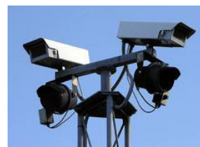
Closed Circuit Television Cameras