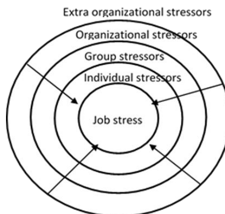
Figure 1: Categories of stressors

The antecedents of stress, or the so-called stressors, affecting today's employees are summarized in the following Figure 1. As shown in it, these causes come from both outside and inside the organization and from the groups that employees are influenced by and from employees themselves.