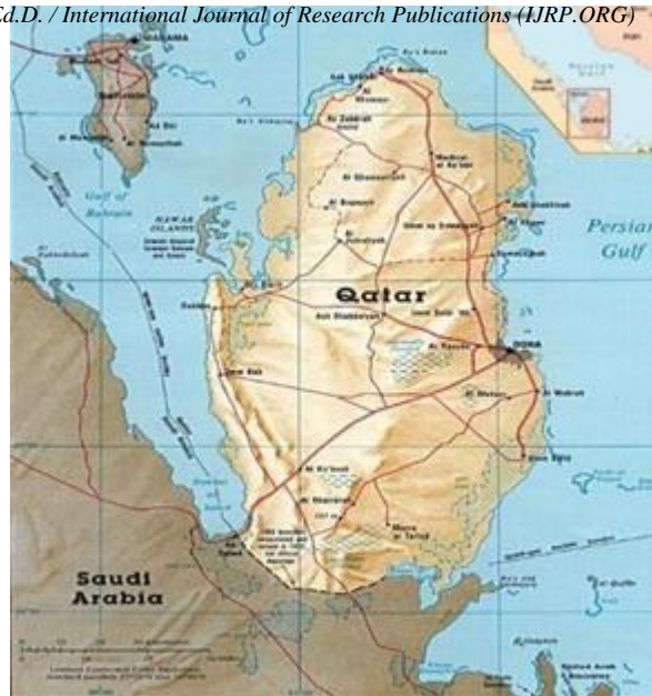
Figure 1: Location of Philippine School Doha